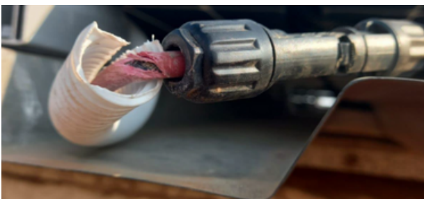
Damaged PV cable insulation can create dangerous hot connections and fire risk

Repairs and Maintenance - In addition, our repairs and replacements service ensures that faults, component failures, or unexpected breakdowns are restored quickly. Minimizing downtime is essential for businesses where reliable power underpins productivity.